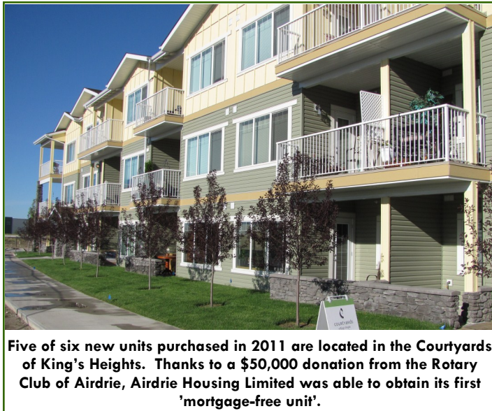
Five of six new units purchased in 2011 are located in the Courtyards of King's Heights. Thanks to a $50,000 donation from the Rotary Club of Airdrie, Airdrie Housing Limited was able to obtain its first 'mortgage-free unit'.

In 2011, Airdrie Housing Limited was able to add six new condominiums to its housing portfolio for a total of 44 units. Five of the latest additions are located in Phase 2 of The Courtyards of King's Heights and consist of four 1-bedroom units and one 2-bedroom unit. The sixth unit is located in Phase One of The Edge and is a partially wheelchair accessible suite. Affordable units rent at 10% below market rate and tenants who qualify may also receive a rent supplement.